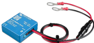
Bluetooth sensing: Smart Battery Sense