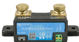
Bluetooth sensing: SmartShunt