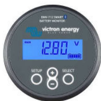
Bluetooth sensing: BMV-712 Smart Battery Monitor