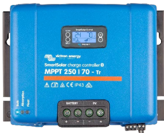
SmartSolar Charge Controller MPPT 250/70-Tr with optional pluggable display