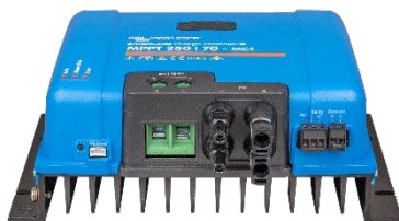
SmartSolar Charge Controller MPPT 250/70-MC4 without display