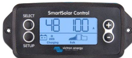
SmartSolar pluggable display

Simply remove the rubber seal that protects the plug on the front of the controller, and plug-in the display.