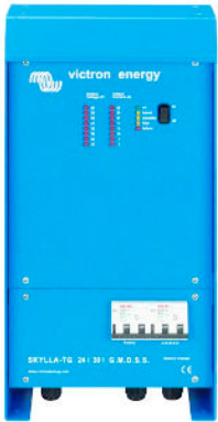
Skylla TG 24 30 GMDSS