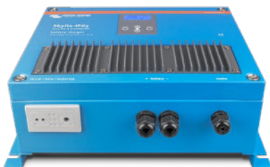
Skylla-IP65 12/70 (1+1)

To learn more about batteries and charging batteries, please refer to our book 'Energy Unlimited' (available free of charge from Victron Energy and downloadable from www.victronenergy.com ).