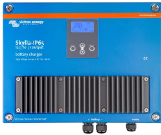
Skylla-IP65 12/70 (1+1)