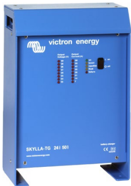
Skylla Charger 24 V 50 A