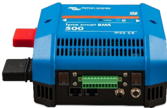
Lynx Smart front angle