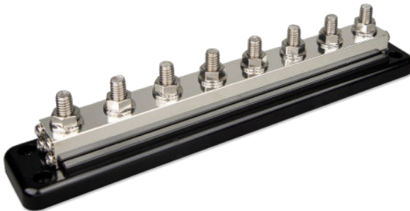
Busbar 600 A with 8 high current terminals and 8 low current screw terminals, without cover