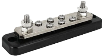
Busbar 250 A 2P with 6 screws