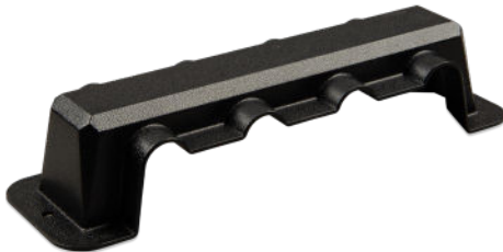
Cover for busbar 250 A with 12 screws