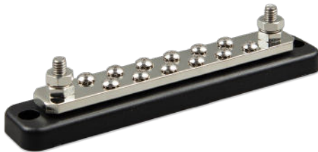
Busbar 250 A 2P with 12 screws