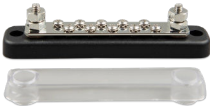
Busbar 150 A 2P with 10 screws and cover