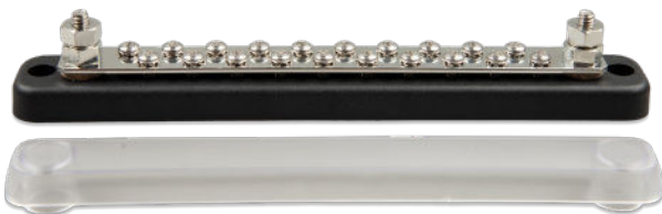
Busbar 150 A 2P with 20 screws and cover