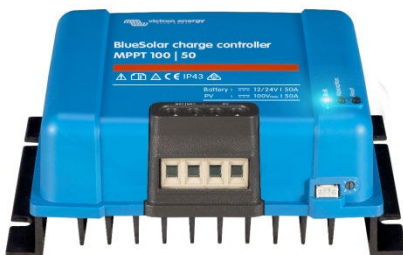
BlueSolar Charge Controller MPPT 100/50