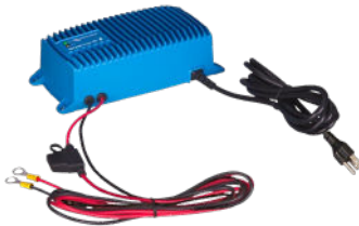
Blue Smart IP67 Charger 12/25