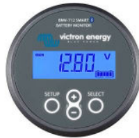
BMV-712 Smart Battery Monitor