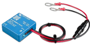
Smart Battery Sense Enables temperature and voltage compensated charging.