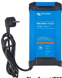
Blue Smart IP22 12/30 (3)