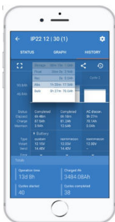
One of the history screens