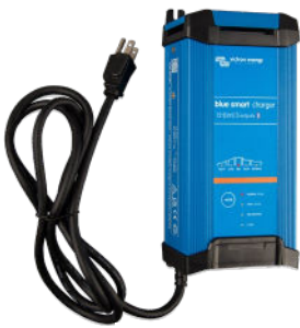
Blue Smart IP22 12/30 (3)