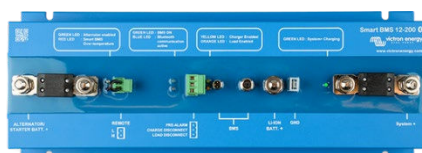
Smart BMS 12/200