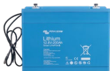
Lithium Battery 12,8V & 25,6V Smart