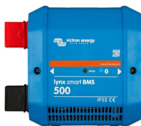
Lynx Smart BMS