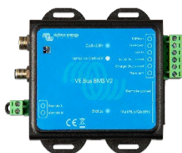
VE.Bus BMS V2