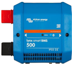
Lynx Smart BMS