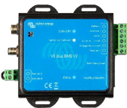
VE.Bus BMS V2